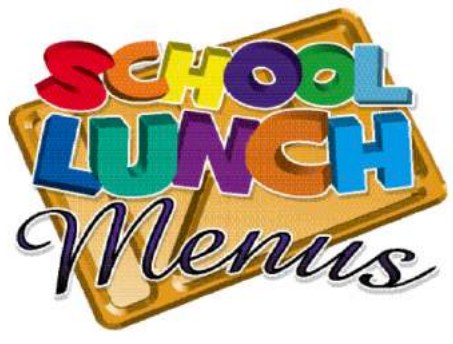
November Menu Menus are subject to change.